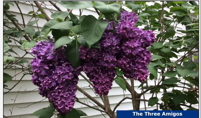
The Three Amigos

Not Included: Lunches, Beverages, Tips to your guide & driver Available at optional: Travel Insurance ( www.206tours.com/insurance ), Extended Cancellation Protection Plan @ $299 ( www.206tours.com/cancellationprotection )