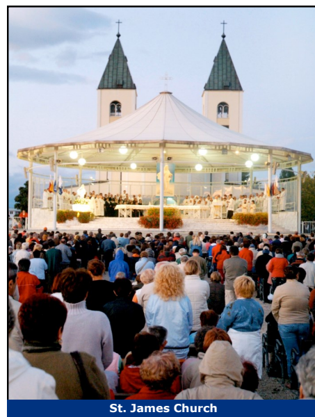
St. James Church